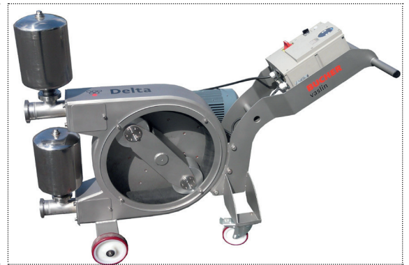
Peristaltic pump for wine

The Delta DP pump is a peristaltic pump with two functions: pump for fresh grapes and wine.